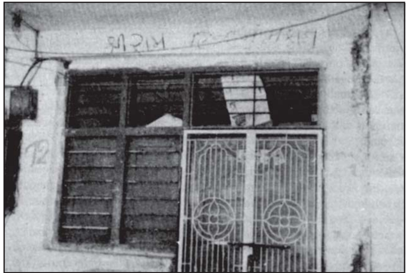
“Shri Ram, Hindu makaan (house) written outside a home

Women, as pointed out earlier, were often at the receiving end of the attacks. A few were raped, then beaten and killed. Some were gangraped. In