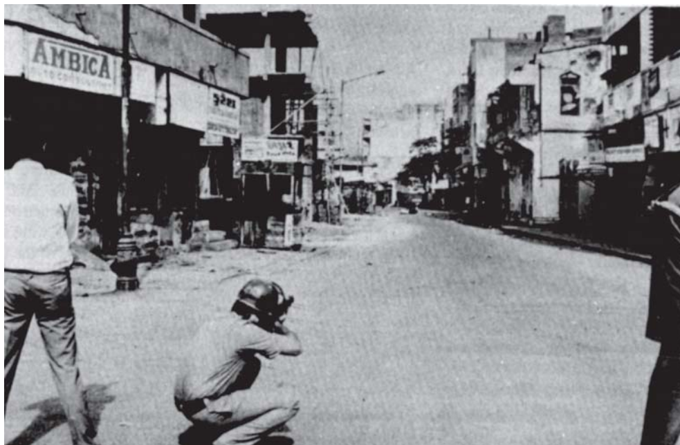
Selective targeting of Muslims; photo from Ahmedabad riots

"After some time, we saw a group of people in khadi uniform who we thought were policemen. But that was